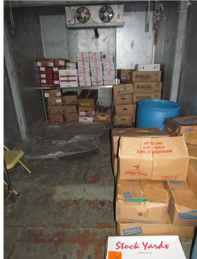
Meat donated from Stock Yard Meat Company.